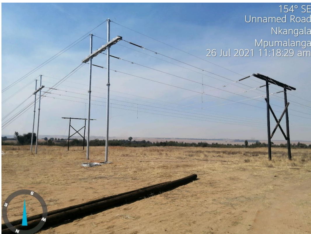
Figure 1: Remaining construction material to be removed off site.