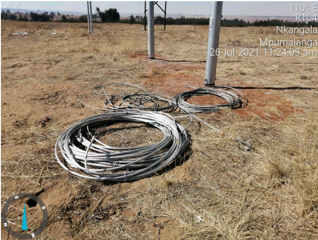
Figure 2: Remaining construction material to be removed off site.