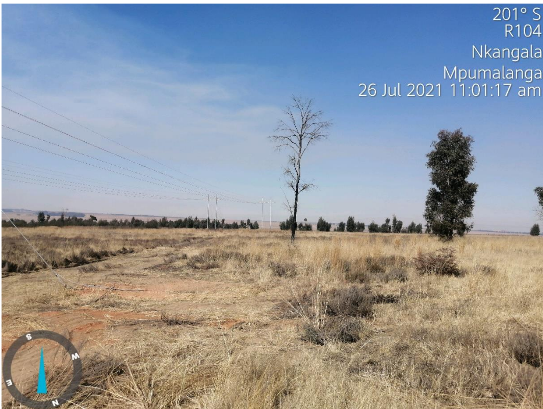
Figure 3: Image taken on the day of the audit.