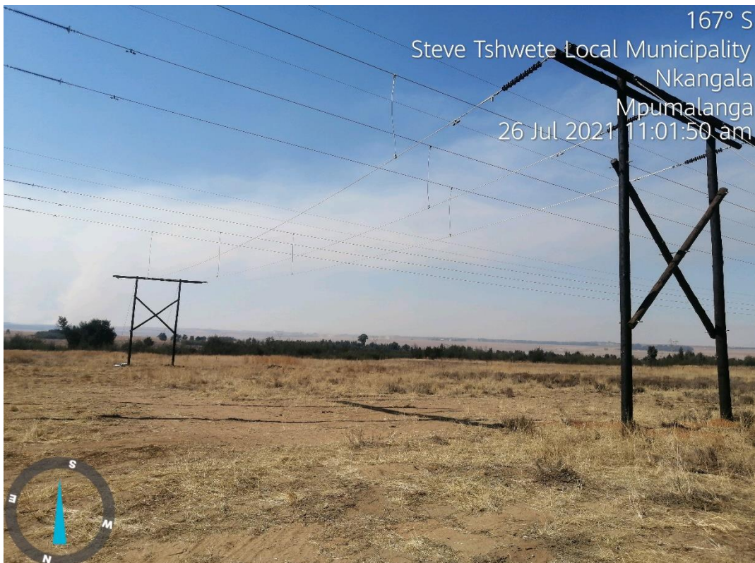
Figure 2: Images taken on the day of the audit.