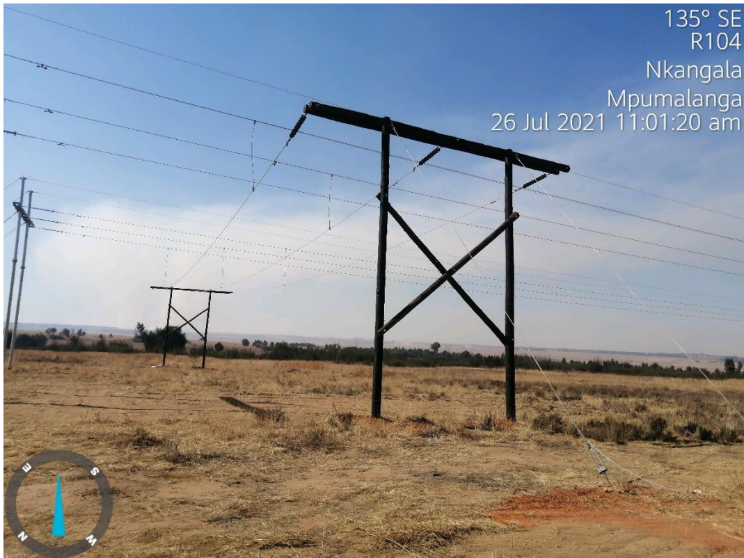
Figure 1: Images taken on the day of the audit.